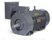
Motores Media Tensión 2,300-13,800V Power: 100 – 2500 HP