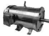
Motores Washdown Acero Inoxidable Power: 1/2 – 10 HP