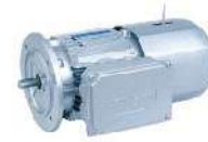
Motores Métricos IEC Power: 0.09 – 7.5 KW Brida B5 y B14