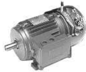
Motores Metric IEC Power: 0.09 – 7.5 KW Brida B5 y B14